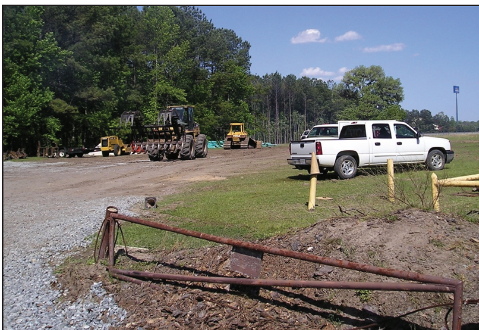
The road system is almost complete, and the water and sewer lines should be finished within 30 days.

Other members of the consulting team include Dempsey Land Design and Thomas & Hutton Engineering. ■